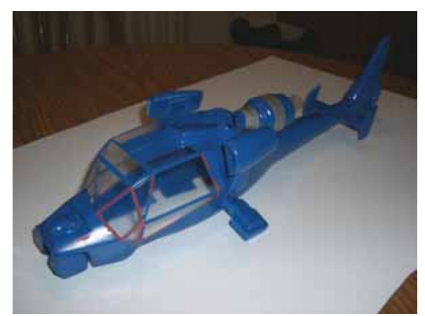
In these pictures I have the gun mounted on the wrong side. See the picture below.