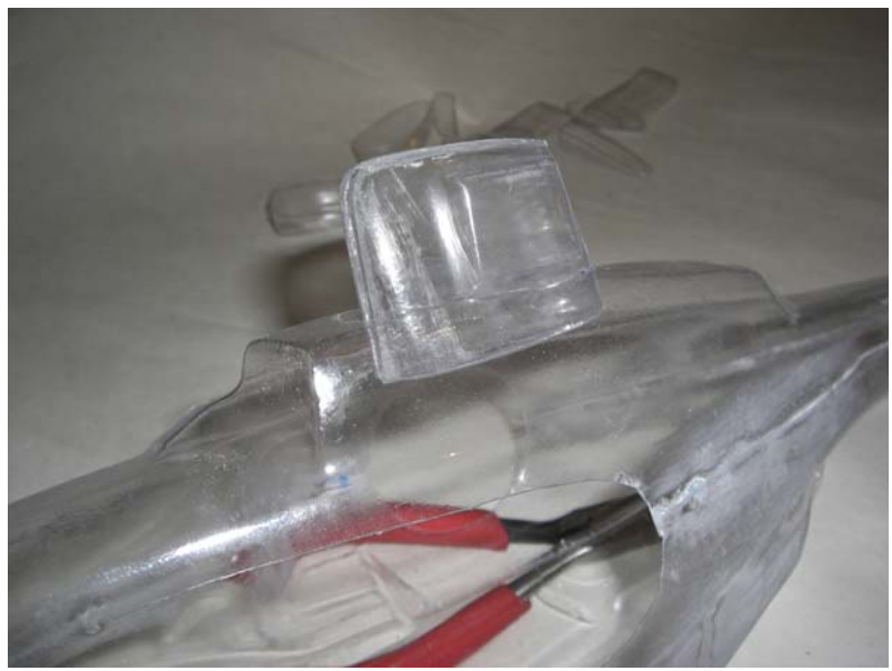
In the picture above the wing is inserted through the back.

When building the Bell, assemble the wings and install them to the outside of the fuselage.